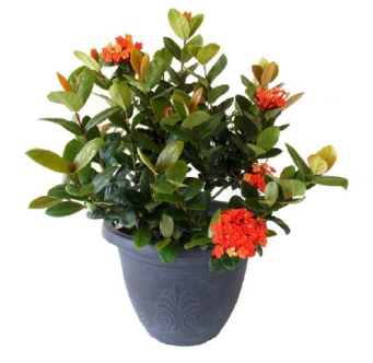
Flame of the Woods (Ixora c. 'Maui Red')