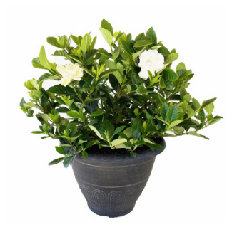
Everblooming Gardenia (Gardenia jasminoides 'Veitchii)