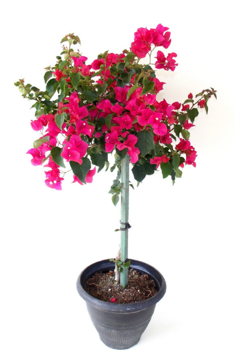
Barbara Karst Bougainvillea (Bougainvillea 'Barbara Karst')