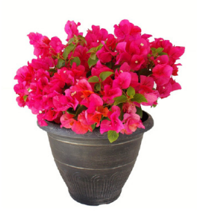
La Jolla Bougainvillea (Bougainvillea 'La Jolla')