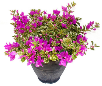
Blueberry Ice Bougainvillea (Bougainvillea 'Blueberry Ice')