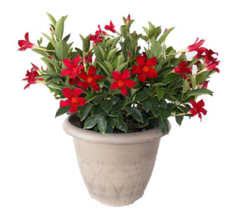
Mandevilla Madinia Pink/Red mix